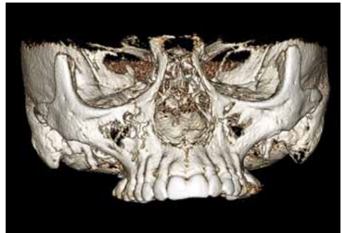
Fig. 2: For volumetric reconstruction of the craniomaxillary region, appropriate software was implemented and midfacial reconstruction was undertaken prior to further processing for measurement purposes