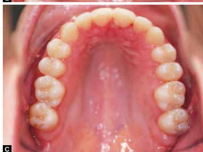
Figs 5A to C: An example of midfacial development in one of the subjects that participated in this study: (A) Pretreatment presentation, (B) the progress of midfacial development, (C) The outcome in this particular example, in which the palatal bone width appears to have increased

percentage measurement error. At 18 months, these data measurements were repeated and the findings were subjected to statistical analysis, using t-tests.