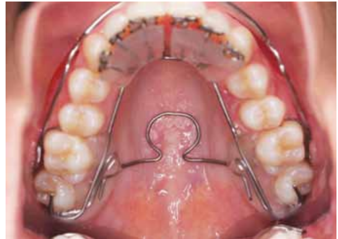
Fig. 1: The wireframe DNA appliance design used in this case, which incorporates midline anterior and posterior omega loops, three-dimensional axial springs TM , Adam's clasps, occlusal stops and a labial bow

Following diagnostics, a biomimetic, upper DNA appliance 7-13 (Fig. 1) was prescribed for each subject. The DNA appliance system is designed to correct maxillomandibular underdevelopment in both children and adults. The wireframe DNA appliance used in this study had six (patented) anterior 3D axial springs TM , midline anterior and posterior omega loops, posterior occlusal stop, retentive clasps, and a labial bow (see Fig. 1). All subjects were instructed to wear the DNA appliance during the late afternoon, early evening and at night time (for approx. 10-12 hrs in total), but not during the day time and not while eating, partly in line with the circadian rhythm of tooth eruption, 14 although this only